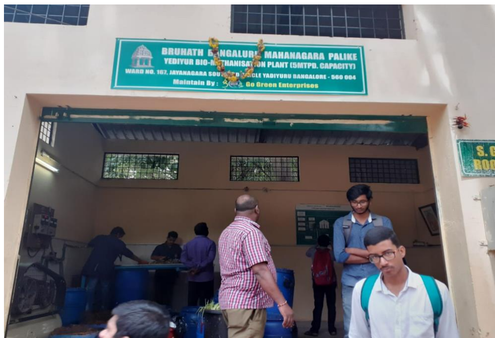
BIO METANATION CENTER -YEDIYUR